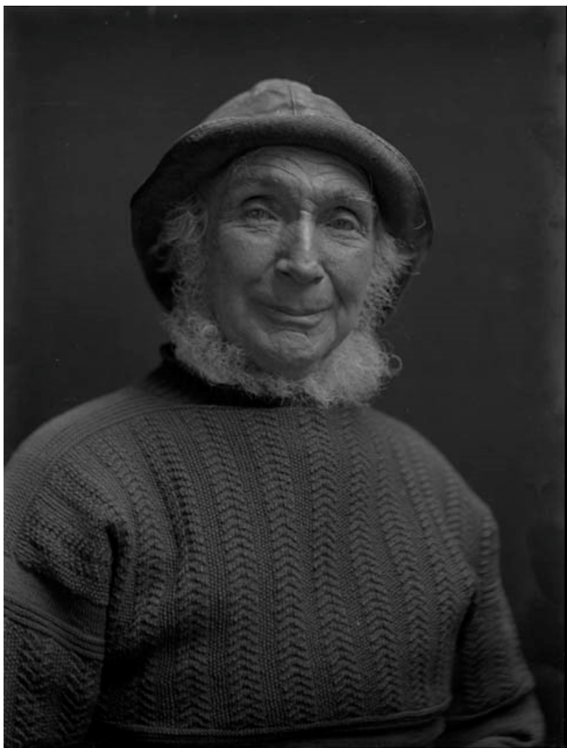
Cromer Museum CR09104.jpg.